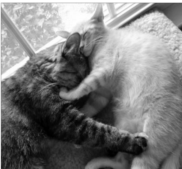
Mini & Malley