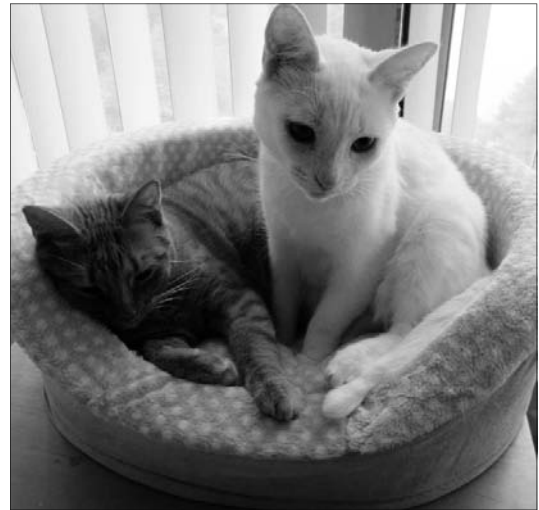
Harley & Rhu

Ever since we started getting new foster kittens, our cats have been trying to get along. And we really love our two kitties and we are happy we got to adopt them."